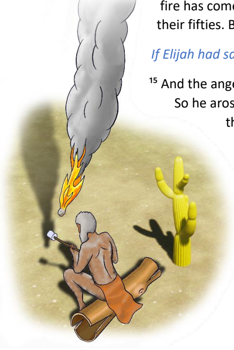
Later in life, Elijah actually got pretty proficient at calling down fire.

How many people died in this chapter? Was the knowledge of whether Ahaziah would live worth all of the deaths?